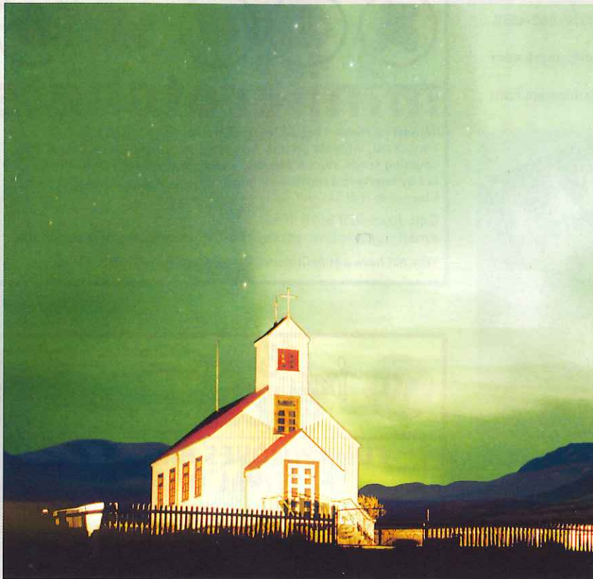
Northern Lights to satisfy the scientist in your family – Travel Matters